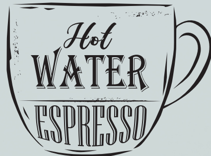
Americano *30ml Espresso 56K