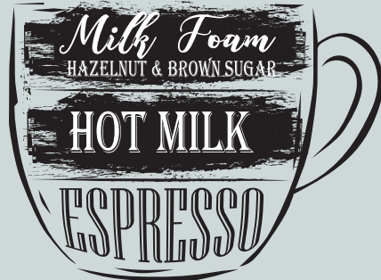
Crème Brulee *30ml Espresso 55K