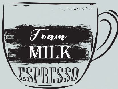
Macchiato *30ml Espresso 49K