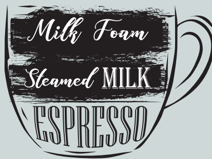
Cappuccino *30ml Espresso 56K