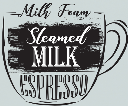
Café Latte *30ml Espresso 56K